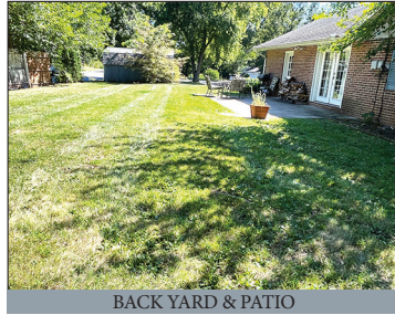
BACK YARD & PATIO