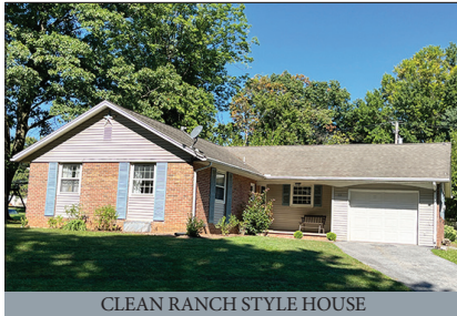
CLEAN RANCH STYLE HOUSE