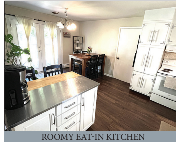
ROOMY EAT-IN KITCHEN