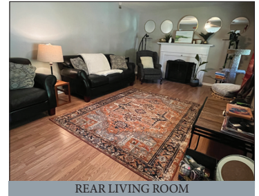
REAR LIVING ROOM

Located at 22 Faust Ln. Denver Pa. 17517