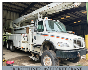
FREIGHTLINER 105' BUCKET CRANE