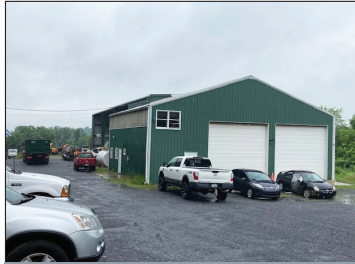
INCLUDES SHOP SPACE