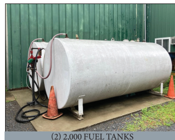
(2) 2,000 FUEL TANKS