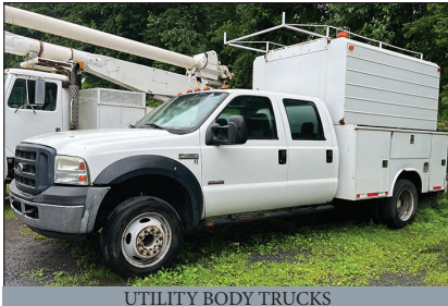
UTILITY BODY TRUCKS