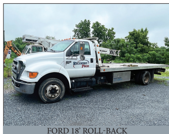
FORD 18' ROLL-BACK