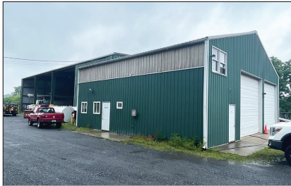
LARGE INDUSTRIAL BUILDING

4.1 ACRE INDUSTRIAL PROPERTY * R/R FRONTAGE 140'x 50' BUILDING w/ TRUCK SHOP & OPEN STORAGE TRUCKS * FLATBEDS * BACK-HOE * SKID-LOADER * P & H CRANE BUCKET TRUCKS * STUMP-GRINDERS * TOOLS * TRAILERS SATURDAY OCT. 1 2022, @ 8:30 AM * R.E. @ 2:00 PM