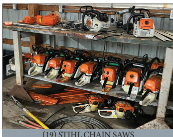
(19) STIHL CHAIN SAWS