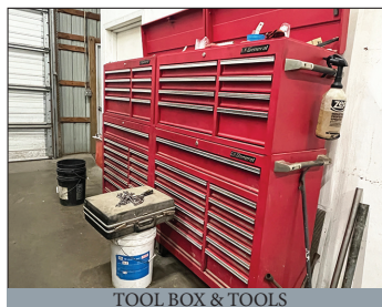
TOOL BOX & TOOLS