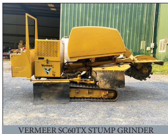
VERMEER SC60TX STUMP GRINDER