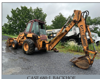
CASE 680-L BACKHOE