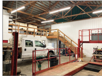
INSIDE SHOP & MEZZANINE AREA