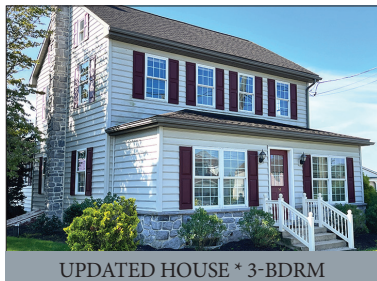
UPDATED HOUSE * 3-BDRM

BEAUTIFUL 2-STORY HOUSE * RECENT UPDATES 40'x 28' DETACHED 3-BAY GARAGE * .48 ACRE LOT 3-BR's * BEAUTIFUL KITCHEN * MOVE-IN CONDITION THURSDAY SEPT. 22, 2022 @ 6:00 PM