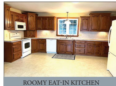
ROOMY EAT-IN KITCHEN

Located at 334 Linden Grove Rd. Ephrata Pa. 17522