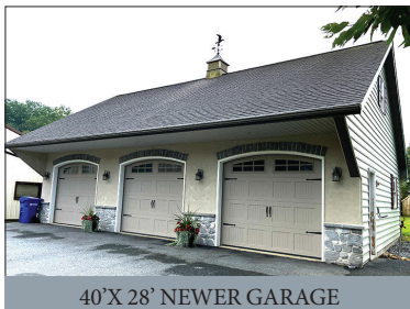
40'X 28' NEWER GARAGE