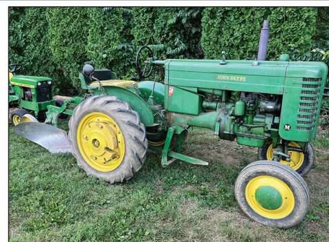
JOHN DEERE MODEL "M"

Located at 800 Summit Circle Lititz Pa. 17543