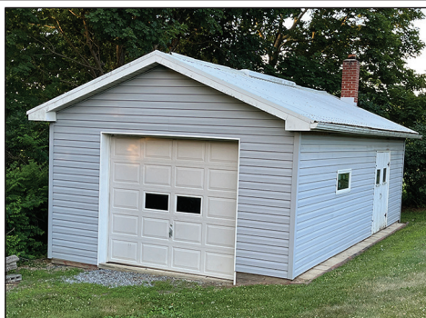
(2) DETACHED SHOPS