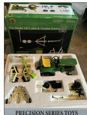
PRECISION SERIES TOYS

GUNS. TOYS. HOUSEHOLD: CZ-model 452-2EZKM .22 rifle w/ scope; Remington model 510X .22 single shot rifle; automatic washer & dryers; Pine corner cupboard; roll-top desk; double bed; chest of drawers; cedar chest; file cabinets; child's rocker; Baby-Loc serger sewing machine; 20" Eagle Lebanon old school house bell; Myers water pump; Cast-iron trough; retro metal porch chairs; John Deere toys including (5) Precision Series; (10+) John Deere tractors; model 60 tractor w/ picker-head, 5020 model w/ chopper & wagon; 50th anniversary set; JD 7410 pedal tractor & wagon; CAT child's track-hoe; JD porcelain doll; (25+) cast-metal trucks; old tin train set; oil lamps; old platform scales; misc. framed pictures; old galv. cans; misc. reading & church books; Gold Waltham & other pocket watches; old records & 8-tracks; Rainbow sweeper; fireplace tools; handmade quilts & soft goods; table clothes; (30+) peanut butter glasses; Princess-House glassware; collectible glassware; Kitchen-Aid mixer; Kettles; green-colored Pyrex bowl; green jars; salt-glazed jug; (20+) plastic tubs & lids; nice household dishes; Silver half dollars; (65+) silver quarters; Buffalo nickels; large 1-cent coins.