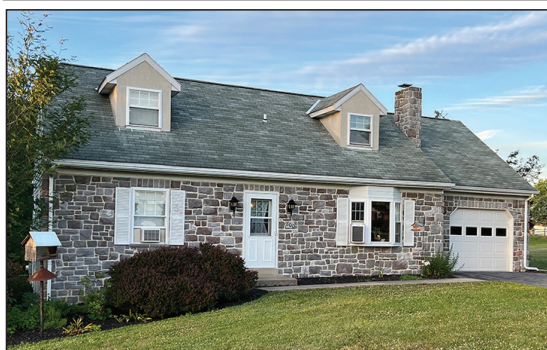
STONE 4-BR CAPE COD

CAPE COD STYLE HOUSE w/ 4-BR's * 3 BATHROOMS 2-ACRE LOT * DETACHED SHOP * INSIDE NEEDS TLC TOOLS * JD "M" TRACTOR * HOUSEHOLD ITEMS SAT., SEPTEMBER 17, 2022 @ 8:30 AM * RE @ 1:00 PM