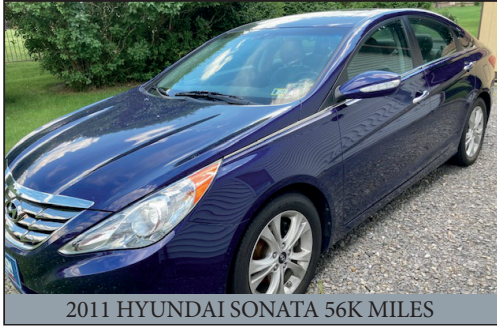
2011 HYUNDAI SONATA 56K MILES

3-BDRM 2-BATH RANCHER w/1-CAR GARAGE * .40-AC. LOT 1,232 Sq. Ft. HOME BUILT IN 1987 * 2011 HYUNDAI SONATA! FRIDAY, SEPTEMBER 16, 2022 @ 6:30 PM