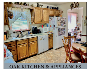
OAK KITCHEN & APPLIANCES