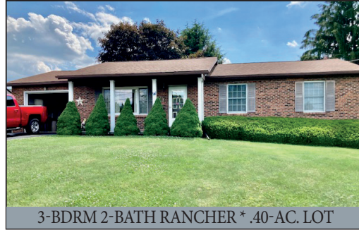
3-BDRM 2-BATH RANCHER * .40-AC. LOT