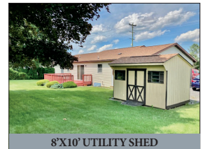
8'X10' UTILITY SHED

For complete listing visit www.martinandrutt.com