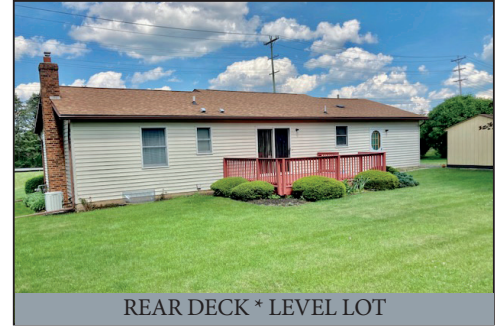
REAR DECK * LEVEL LOT

Located at: 2471 W. College Ave. State College, PA Ferguson Twp. Centre Co.