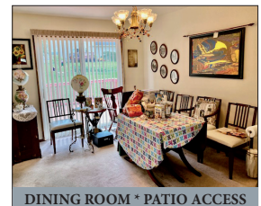
DINING ROOM * PATIO ACCESS