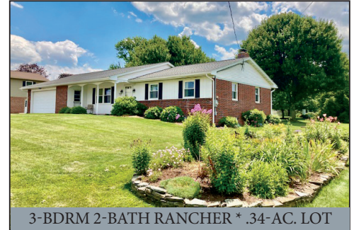
3-BDRM 2-BATH RANCHER * .34-AC. LOT

Located at: 606 S. Kinzer Ave. New Holland, Pa. Earl Twp. Lancaster Co.