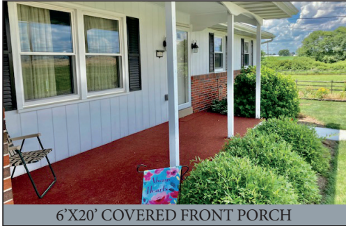
6'x20' COVERED FRONT PORCH

3-BDRM 2-BATH BRICK RANCHER w/2-CAR GARAGE * .34-AC. LOT JD STX38 MOWER * GENERATOR * ANTIQUES & PERSONAL PROPERTY SATURDAY, SEPTEMBER 10, 2022 @ 9-AM/Real Estate @ NOON