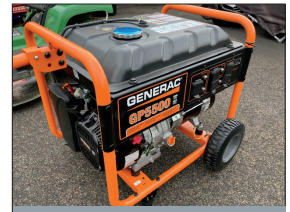
GENERAC 5500 GENERATOR