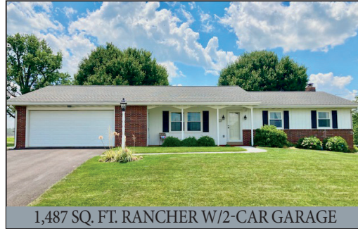
1,487 SQ. FT. RANCHER W/2-CAR GARAGE