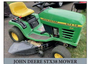
JOHN DEERE STX38 MOWER

Terms: Cash, PA check, credit card w/3% fee, good food by Black Diamond catering; sale held under tent, please bring a chair.