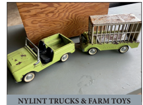
NYLINT TRUCKS & FARM TOYS