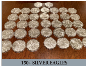
150+ SILVER EAGLES