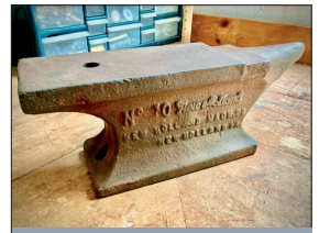
NEW HOLLAND NO.10 ANVIL