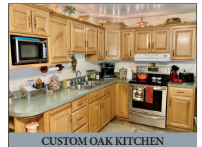
CUSTOM OAK KITCHEN