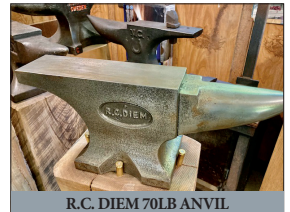
R.C. DIEM 70LB ANVIL