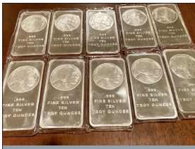
26-10OZ. SILVER BARS