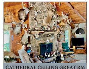
CATHEDRAL CEILING GREAT RM

OPEN HOUSE: SAT. JULY 30 & AUG. 6 from 1-3 PM for info call/text auctioneer @ (717) 371-3333.