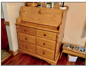
CUSTOM OAK ROLL TOP DESK