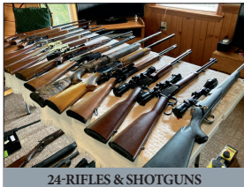
24-RIFLES & SHOTGUNS

** TO BE MOVED: Nice 32' x 14' Vinyl Utility Shed w/9' O/H door! Sells after real estate! **