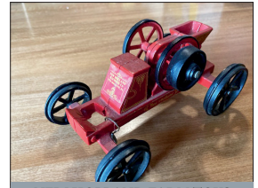
NEW HOLLAND FARM TOYS