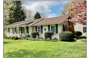
1,700 SQ. FT. RANCHER

REAL ESTATE: consists of a 1,304 sq. ft. 3-bdrm rancher; 3-bay garage; heated shop; utility sheds & 1-acre pond! Main floor features a stunning great room w/pine cathedral ceiling & stone fireplace; covered rear patio; custom oak cabinetry kitchen w/appliances; dining room w/HW floors; full bath; 3-bedrooms w/HW floors & closets; daylight walkout lower level includes laundry hook-up; storage area; central AC/oil furnace; 200 amp svc; on-site well & septic; annual taxes: $5,166. Outbuildings: a 24'x32' 3-bay garage/shop; a 20'x16' heated shop w/porch; several utility/wood storage sheds; a beautiful 1-ac. pond; plenty of space for pasture or gardens!