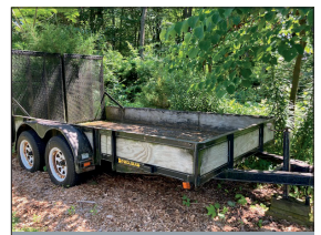
PEQUEA LANDSCAPE TRAILER