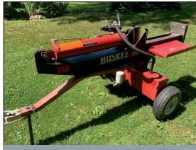
HUSKEE 27 TON LOG SPLITTER