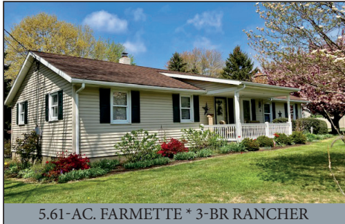
5.61-AC. FARMETTE * 3-BR RANCHER

SATURDAY, AUGUST 20, 2022 @ 8:30 AM/ Real Estate @ 1-PM