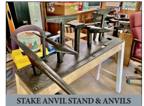
STAKE ANVIL STAND & ANVILS