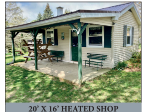
20' X 16' HEATED SHOP