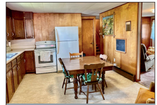
EAT-IN STYLE KITCHEN

**Broker Participation Invited-Contact Auctioneer** For photos & complete listing visit www.martinandrutt.com