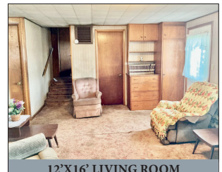
12'X16' LIVING ROOM