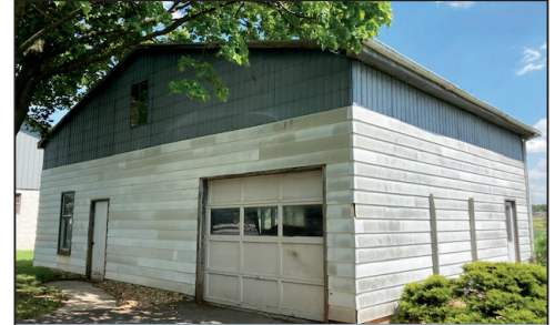
1,120 SQ. FT. BARN/SHOP

Located at 670 Lancaster Ave. New Holland, PA Earl Twp. Lancaster Co.