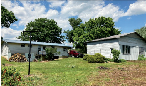
.43-AC. COUNTRY LOT W/HOUSE & BARN