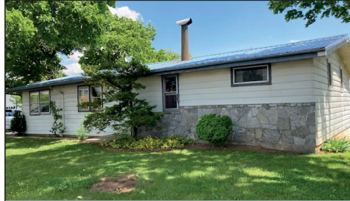
1,230 SQ. FT. 3-BDRM FRAME RANCHER