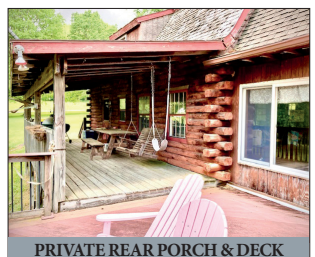
PRIVATE REAR PORCH & DECK