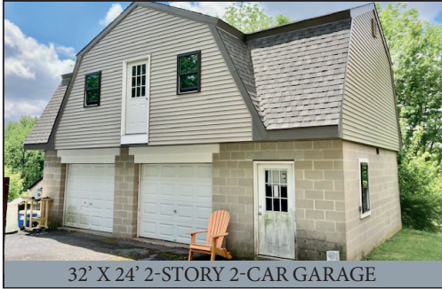
32' X 24' 2-STORY 2-CAR GARAGE