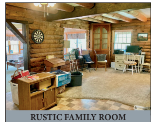
RUSTIC FAMILY ROOM