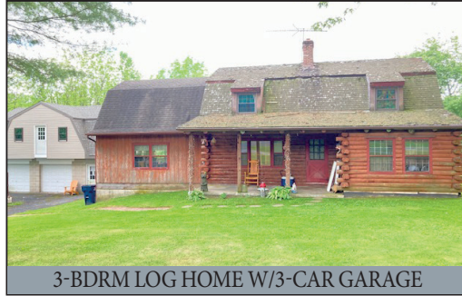
3-BDRM LOG HOME W/3-CAR GARAGE