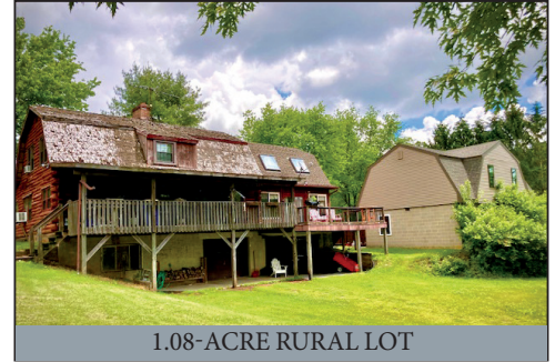
1.08-ACRE RURAL LOT

Located at 5370 Candy Ln. New Holland, PA Salisbury Twp. Lancaster Co.