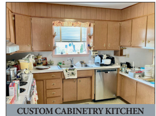
CUSTOM CABINETRY KITCHEN

TERMS: Cash, PA check or credit card w/3% fee, food available, sale held under tent, bring a chair!