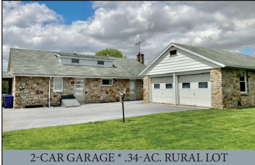
2-CAR GARAGE * .34-AC. RURAL LOT

3-4 BDRM STONE RANCHER * 2-BAY GARAGE * .34-AC. LOT 1990 OLDS * GOLD COINS * ANTIQUES * PERSONAL PROPERTY SATURDAY, JULY 30, 2022 @ 8:30 AM/Real Estate @ 1-PM