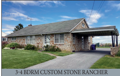
3-4 BDRM CUSTOM STONE RANCHER