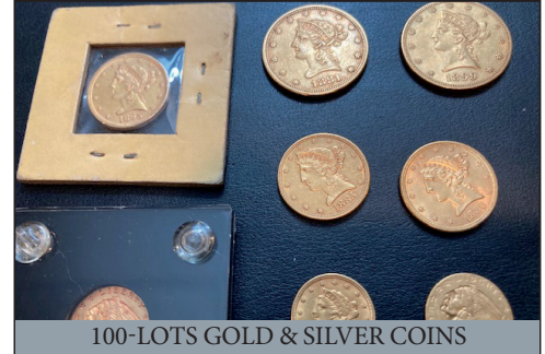
100-LOTS GOLD & SILVER COINS

Located at 141 S. Shirk Rd. New Holland, PA Earl Twp. Lancaster Co.