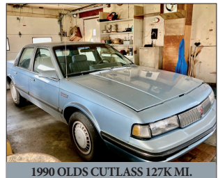
1990 OLDS CUTLASS 127K MI.