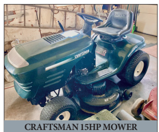
CRAFTSMAN 15HP MOWER