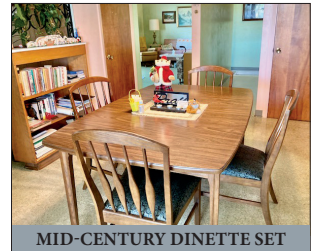
MID-CENTURY DINETTE SET