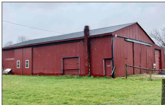
80'x 44' TRUCK SHOP

15.9 ACRE FARM * OLDER 2-STORY HOUSE w/ 3 BEDROOMS 80'x 44' SHOP FOR LARGE TRUCKS * STORAGE UNITS NEWER BANK BARN FOR ANIMALS & STORAGE * PASTURE THURSDAY, JULY 28, 2022 @ 6:00 PM