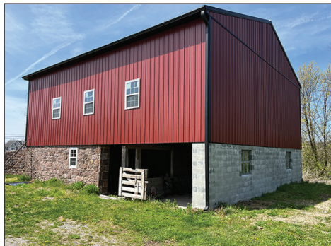
4-YEAR OLD BANK BARN