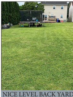
NICE LEVEL BACK YARD