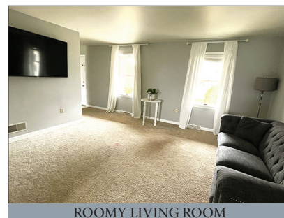
ROOMY LIVING ROOM

Located at 303 Wissler Rd. New Holland Pa. 17557