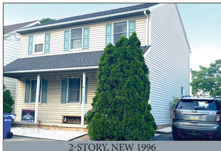
2-STORY, NEW 1996