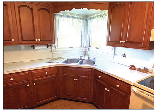
BEAUTIFUL BIRCH KITCHEN

Located at 1152 Division Hwy. Ephrata Pa. 17522