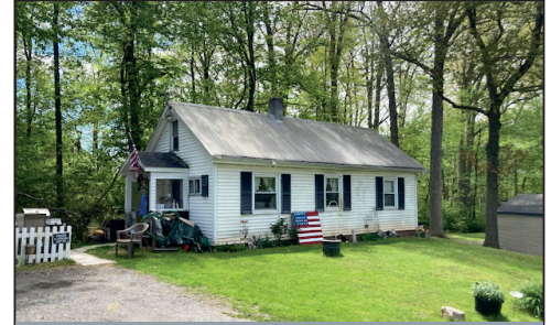
1-BDRM FRAME 512 SQ. FT. COTTAGE

Located at 551 Lauschtown Rd. Denver, PA Brecknock Twp. Lancaster Co.