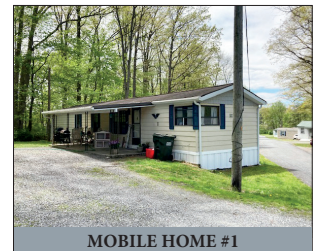
MOBILE HOME #1