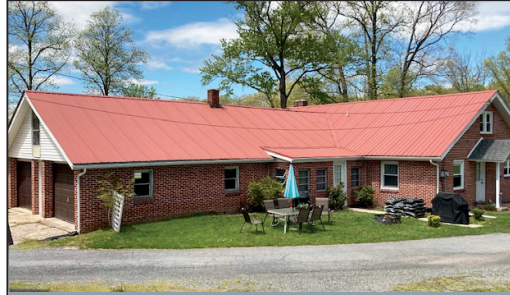
1,875 SQ. FT. RANCHER W/2-CAR GARAGE