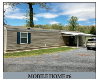
MOBILE HOME #6