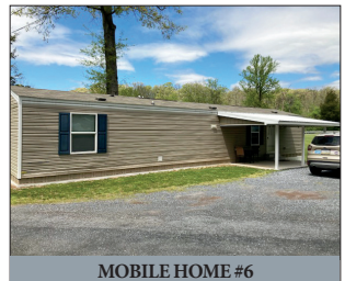
MOBILE HOME #6