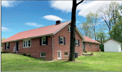
3-BDRM BRICK RANCHER * 7.3 AC. TRACT

MULTI-RESIDENCE INVESTMENT PROPERTY * 7.3-ACRE TRACT! 3-BDRM BRICK RANCHER * FRAME COTTAGE * 10-MOBILE HOMES & SHEDS THURSDAY, JULY 14, 2022 @ 6-PM