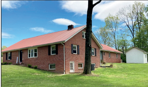
3-BDRM BRICK RANCHER * 7.3 AC. TRACT

MULTI-RESIDENCE INVESTMENT PROPERTY * 7.3-ACRE TRACT! 3-BDRM BRICK RANCHER * FRAME COTTAGE * 10-MOBILE HOMES & SHEDS THURSDAY, JULY 14, 2022 @ 6-PM