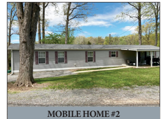
MOBILE HOME #2