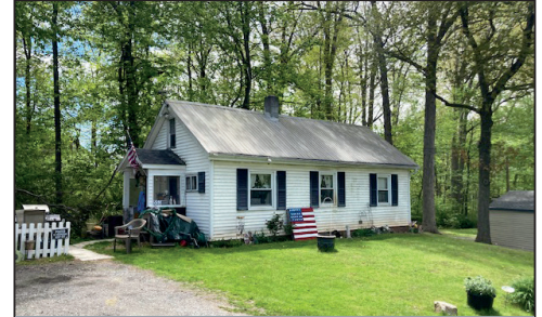
1-BDRM FRAME 512 SQ. FT. COTTAGE

Located at 551 Lauschtown Rd. Denver, PA Brecknock Twp. Lancaster Co.