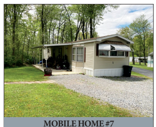
MOBILE HOME #7