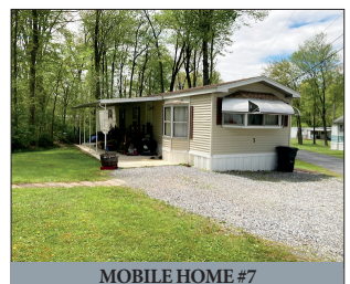
MOBILE HOME #7