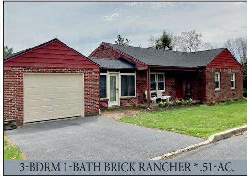
3-BDRM 1-BATH BRICK RANCHER * .51-AC.