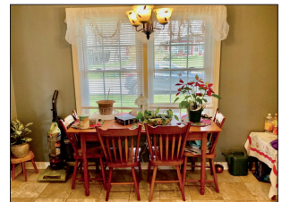
CHARMING BREAKFAST NOOK