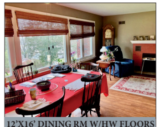
12'X16' DINING RM W/HW FLOORS