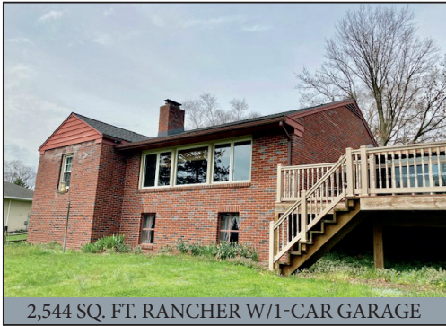
2,544 SQ. FT. RANCHER W/1-CAR GARAGE