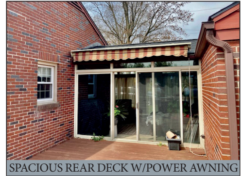
SPACIOUS REAR DECK W/POWER AWNING

Located at 810 Grandview Rd. Akron, Pa. 17501