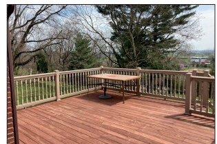
INVITING REAR DECK W/GRAND VIEW!