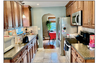
RECENT NEW KITCHEN CABINETS

For photos & complete listing visit www.martinandrutt.com