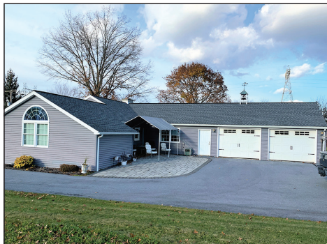
HUGE 2-CAR GARAGE