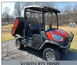
KUBOTA RTV DIESEL

Located at 504 Reinholds Rd. Denver Pa. 17517