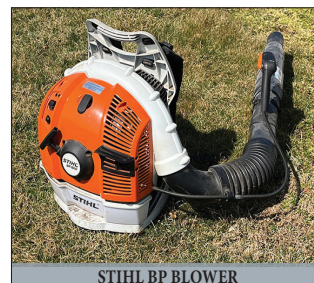
STIHL BP BLOWER