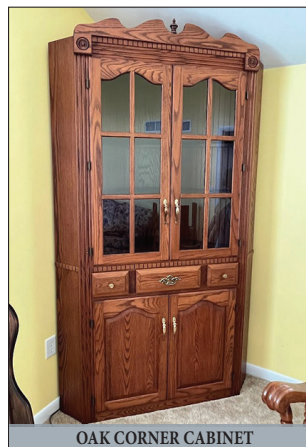
OAK CORNER CABINET