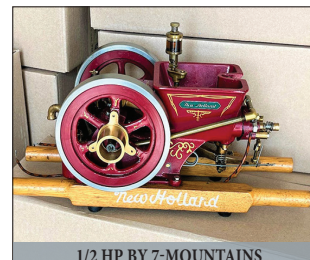
1/2 HP BY 7-MOUNTAINS

SHOP & GARAGE ITEMS: Kubota RTV utility vehicle model X1120-D w/ dump body, roll-cage, power steering, 580 hours; John Deere model 250 Skid steer loader w/ 1420 hours (runs great); quick attach post-hole digger w/ auger bits & wood splitter bit; 66" dirt bucket w/ teeth; 72" clam-bucket; pallet forks; quick attach 4' trencher; 72" 3 pt. field disc; drag harrow; John Deere zero-turn lawn mower Model Z-445, 27-hp, 260 hours; Stihl 0-28 chainsaw w/ 18" bar; Stihl BR-600 backpack blower (like new); Stihl handheld blower; air compressor; Dayton drill press; 200 amp portable electric panel; Lincoln 225 welder; floor jack; battery charger; freon (R-12, 408-A, R-22, 134-A); freon gauges; heat pump furnace; Porter Cable pressure washer, 4000 psi, 4 gal. PM, 15-hp; Onan Marquis 6500 watt propane generator; logging chains; lots of small power tools; fence charger; hand tools; 15-KW propane house generator; wrench sets; mechanic tools; patio pavers; good garage tools.