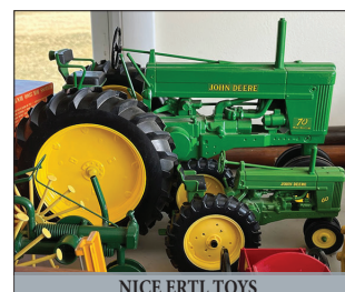
NICE ERTL TOYS