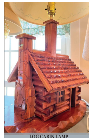
LOG CABIN LAMP