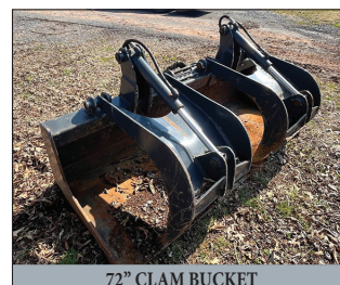
72" CLAM BUCKET