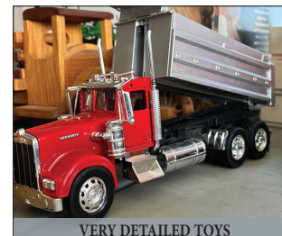
VERY DETAILED TOYS