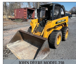
JOHN DEERE MODEL 250