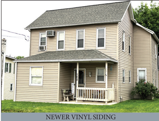
NEWER VINYL SIDING

2-UNIT RESIDENTIAL APARTMENTS * EACH 2-BR WELL MAINTAINED * OFF-STREET PARKING * NICE TUESDAY, JUNE 21, 2022 @ 7:00 PM