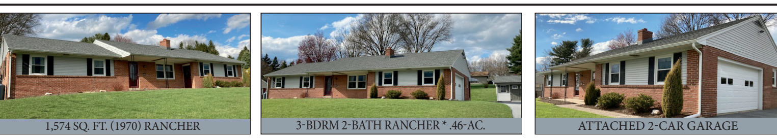
Located at 129 Summitville Rd. New Holland, Pa. Earl Twp. Lancaster Co.

DIRECTIONS: From New Holland Rt. 23 take Brimmer Ave. S becomes New Holland Rd. 1.5-miles to right on Summitville Rd. to home on right.