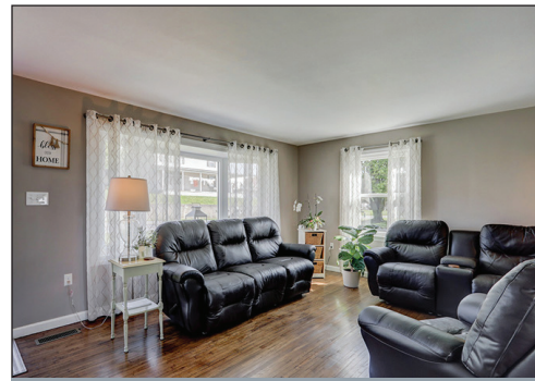
FRONT LIVING ROOM

Located at 205 E. Farmersville Rd. Ephrata Pa. 17522