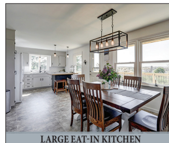
LARGE EAT-IN KITCHEN

REAL ESTATE DETAILS: An extra nice Brick Rancher w/ 3 bedrooms and a wonderful view of the East on .43-acre lot. House was built in 1968 and has approx. 1,200 sq. ft. plus an additional 800 sq. ft. in the basement; eat-in kitchen w/ painted wooden cabinetry, appliances, newer vinyl flooring and tremendous Southern view over picturesque farmland, large pantry; living room w/ front "Bay Style" window & updated flooring; 3-bedrooms w/ closets & hardwood