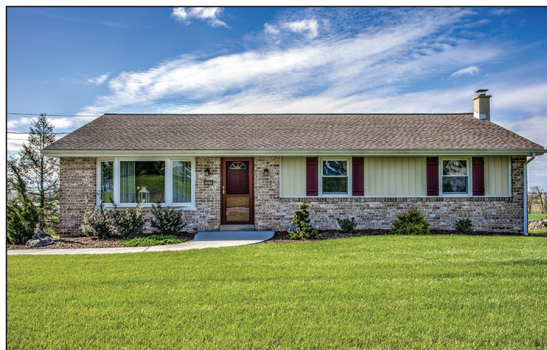
CLEAN BRICK RANCHER

VERY NICE CLEAN RANCH STYLE w/ 3 BEDROOMS 2 FULL BATHROOMS * MANY RECENT UPGRADES .43 ACRE LOT * TREMENDOUS VIEW * NEW DECK THURSDAY, JUNE 16, 2022 @ 7:00 PM