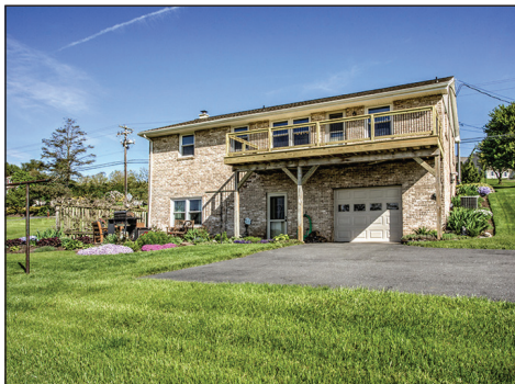
IMPRESSIVE VIEW FROM DECK