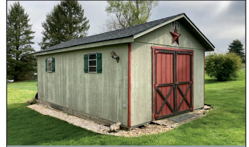
12'X20' UTILITY SHED/SHOP

Located at 1858 White Oak Rd. Strasburg, PA Strasburg Twp. Lancaster Co.