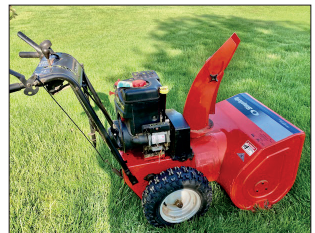
24" SIMPLICITY SNOW BLOWER