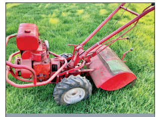
7HP TROY BILT ROTOTILLER