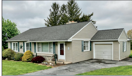
3-BDRM RANCHER W/1-CAR GARAGE