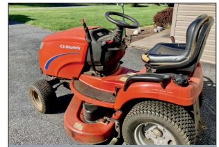
18HP SIMPLICITY LAWN TRACTOR

TERMS: Cash, PA check or credit card w/3% admin fee. Sale held under tent; bring a chair, food available!