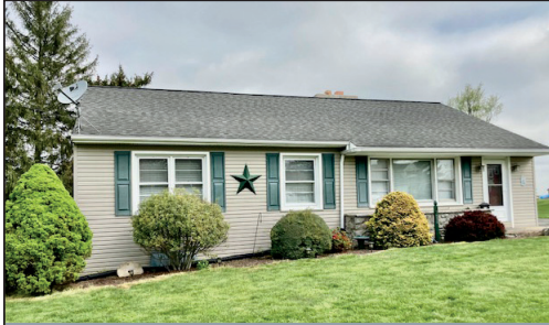
1,410 SQ. FT. RANCHER * .82-AC. LOT

3-BDRM 1-BATH RANCHER w/1-CAR GARAGE * .82-AC. LOT ANTIQUES * TOOLS * LAWN TRACTOR * PERSONAL PROPERTY SAT. JUNE 11, 2022 @ 9-AM/Real Estate @ 1-PM