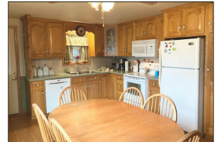
OAK CABINETRY KITCHEN