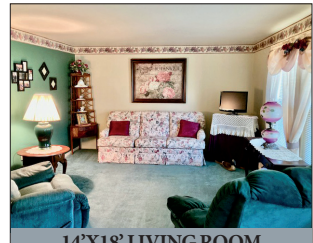
14'X18' LIVING ROOM