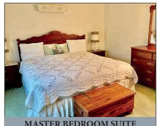
MASTER BEDROOM SUITE