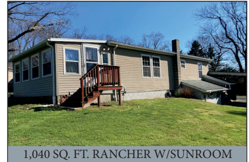
1,040 SQ. FT. RANCHER W/SUNROOM

Located at 428 Yellow Hill Rd. Narvon, Pa. Brecknock Twp. Lancaster Co.