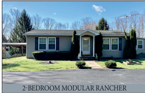
2-BEDROOM MODULAR RANCHER