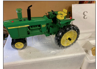
PRECISION JD TOY TRACTORS