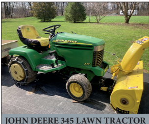
JOHN DEERE 345 LAWN TRACTOR