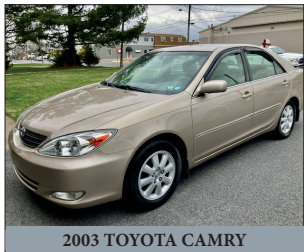
2003 TOYOTA CAMRY