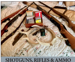
SHOTGUNS, RIFLES & AMMO