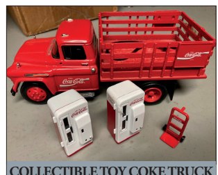
COLLECTIBLE TOY COKE TRUCK