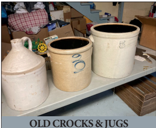
OLD CROCKS & JUGS

CARS: Restored 1931 model "A" Ford w/62k miles, hard-top; green, inline 4-cyl; 3-speed; rumble seat, great car! 2003 Toyota Camry 118k miles, beige, V-6, automatic, power loaded; recent service, clean car!