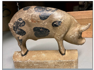
CAST IRON ANIMAL DOORSTOPS