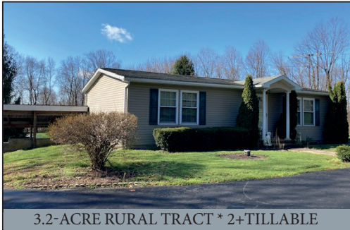
3.2-ACRE RURAL TRACT * 2+TILLABLE

3.2-ACRES * 2-BDRM MODULAR RANCHER * 36'x14' SHOP/SHED 1931 MODEL "A" FORD * GUNS * TOOLS * ANTIQUES 2003 TOYOTA CAMRY * FARM TOYS * JOHN DEERE LAWN TRACTOR SAT. MAY 21, 2022 @ 9-AM/Real Estate @ 2-PM