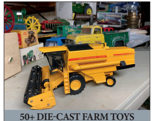
50+ DIE-CAST FARM TOYS