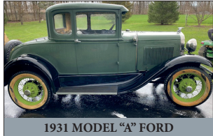
1931 MODEL "A" FORD

Located at 428 Yellow Hill Rd. Narvon, Pa. Brecknock Twp. Lancaster Co.