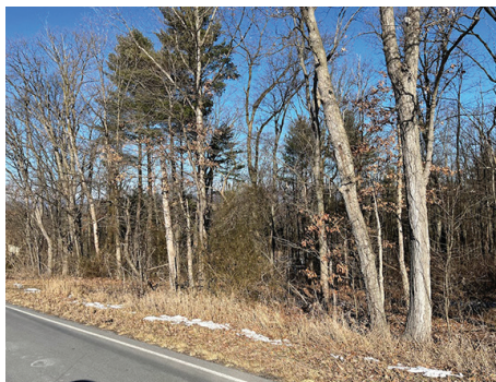
LOTS OF YOUNG OAKS