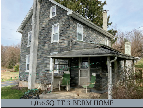
1,056 SQ. FT. 3-BDRM HOME