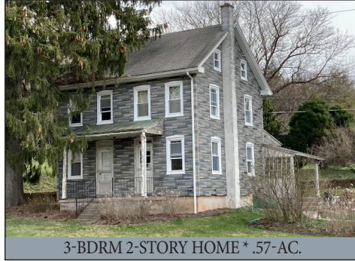
3-BDRM 2-STORY HOME * .57-AC.