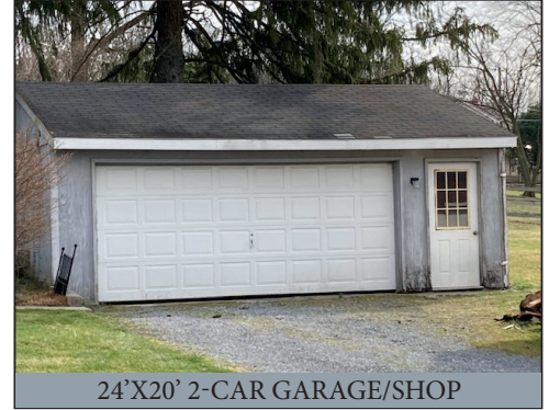
24'X20' 2-CAR GARAGE/SHOP

Located at 395 Holtzman Rd. Reinholds, PA 17569 E. Cocalico Twp. Lancaster Co.