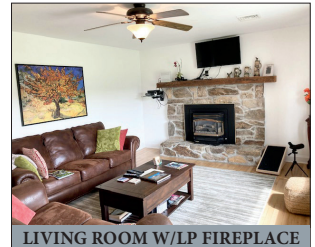
LIVING ROOM W/LP FIREPLACE