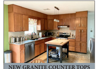
NEW GRANITE COUNTER TOPS

TERMS: CASH, PA CHECK or CREDIT CARD w/3% FEE; food by Caernarvon FC; sale held under tent bring a chair. Nice clean personal property items; sellers moving out-of-state.