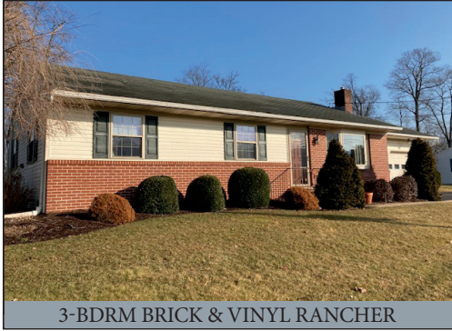
3-BDRM BRICK & VINYL RANCHER

SATURDAY, MAY 14, 2022 @ 9-AM/Real Estate @ NOON