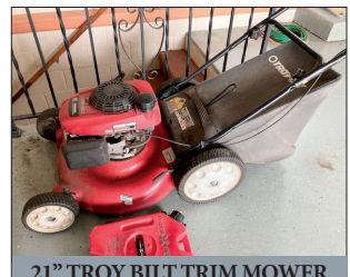
21" TROY BILT TRIM MOWER