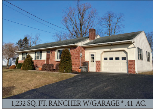
1,232 SQ. FT. RANCHER W/GARAGE * .41-AC.