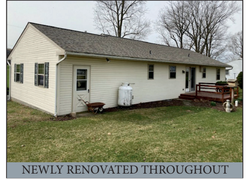
NEWLY RENOVATED THROUGHOUT

Located at 2345 Little Hill Rd. Narvon, PA Caernarvon Twp. Lancaster Co.