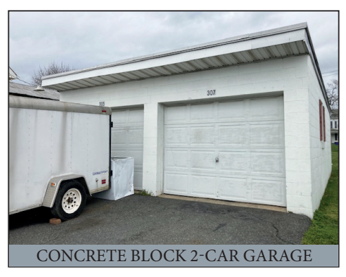
Located at 305-307 E. Main St. Terre Hill, Pa. 17581

DIRECTIONS: From East Earl take Rt. 897 N. to left on Main St. Terre Hill to property on left or alley access @ Charles Shirk Trucking.