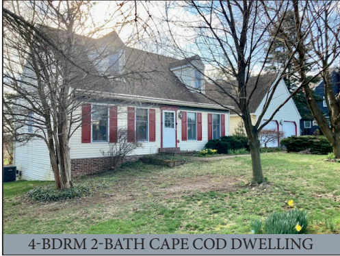
4-BDRM 2-BATH CAPE COD DWELLING

4-BDRM 2-BATH CAPE COD w/2-CAR GARAGE * .34-AC. LOT 1st FLOOR MASTER SUITE * SUNROOM * CENTRAL AC TUESDAY, MAY 10, 2022 @ 6:30 PM