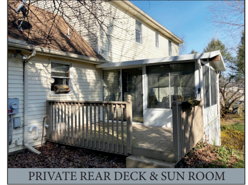
PRIVATE REAR DECK & SUN ROOM

Located at 313 Rudy Dam Rd. Lititz, PA Warwick Twp. Lancaster Co.