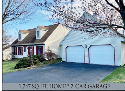
1,747 SQ. FT. HOME * 2-CAR GARAGE