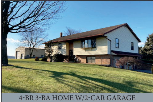
4-BR 3-BA HOME W/2-CAR GARAGE