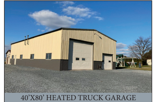
40'X80' HEATED TRUCK GARAGE

Located at 275 Gibble Rd. Myerstown, Pa. Heidelberg Twp. E. Lebanon Co.