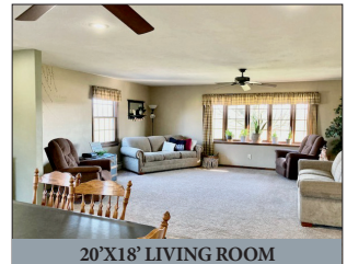
20'X18' LIVING ROOM