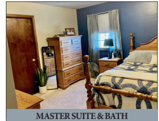
MASTER SUITE & BATH