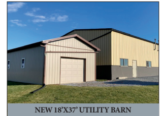
NEW 18'X37' UTILITY BARN

REAL ESTATE: consists of a 2,409 sq. ft. 4-bdrm 3-bath (1980) home w/2-car garage & 40'x80' truck garage on a rural 3.2-acre tract! Main floor features a new custom cabinetry Formica-top kitchen/dining area, appliances included; 20x18 living room w/bay window; full bath; 3-bdrms, master suite includes private bath & bonus rm/library/ den or WIC; laundry room w/sink & cabinetry; enclosed breezeway; 24'x14' in-home office w/private entrance; 18'x18' rear patio; lower level finished 24'x14' family room w/woodstove & brick hearth; bonus 4th bdrm; full bath; 2-car garage; utility room w/central vac; LP furnace HW heat; LP water heater; cold cellar; water treatment system; on site well & septic; 2-1000 gallon LP tanks; annual taxes: $6,503. Outbuildings: include a heated 40'x80' steel building truck garage/shop w/waste oil burner or LP heat; 14'x14' & 10'x10' O/H doors; mezzanine storage; O/H crane hoist; new 18'x37' utility barn w/vinyl siding & 2-O/H doors. Large level parking lot!