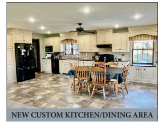
NEW CUSTOM KITCHEN/DINING AREA