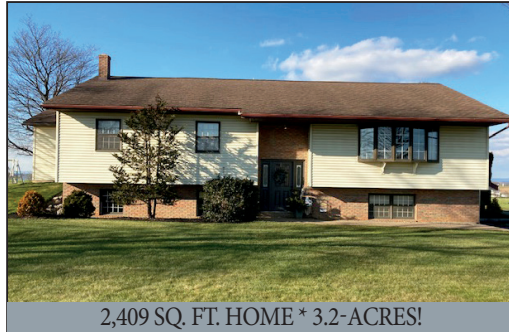
2,409 SQ. FT. HOME * 3.2-ACRES!