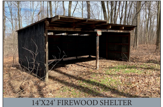
14'X24' FIREWOOD SHELTER

Tract #2) adjoining tract #1 to the east; PIN# 5608540300000 is 10.30-acres of woodland with valuable mature timber w/gentle slope. Annual taxes: $13.