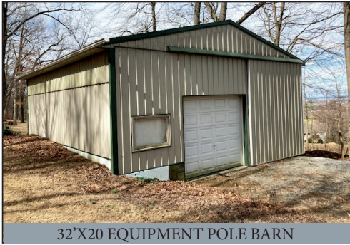
32'X20' EQUIPMENT POLE BARN