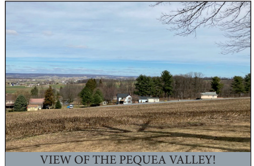
VIEW OF THE PEQUEA VALLEY!

Located along Old Lincoln Hwy. Gap, PA Salisbury Twp Lancaster Co.