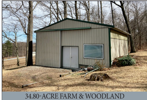
34.80-ACRE FARM & WOODLAND