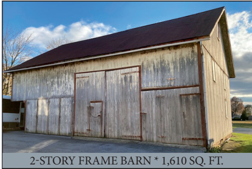
2-STORY FRAME BARN * 1,610 SQ. FT.

SATURDAY, APRIL 2, 2022 @ 9:30 AM/Real Estate @ 11-AM