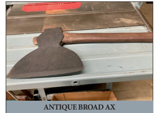
ANTIQUE BROAD AX

TERMS: Cash, PA check or credit card w/3% fee. Auction begins promptly @ 9:30 AM!