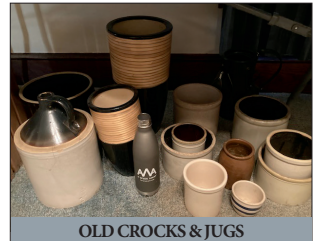
OLD CROCKS & JUGS