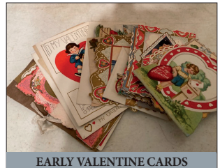
EARLY VALENTINE CARDS