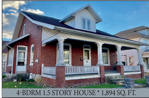
4-BDRM 1.5 STORY HOUSE * 1,894 SQ. FT.