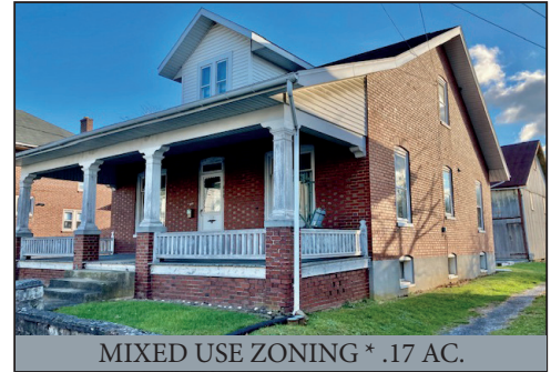
MIXED USE ZONING * .17 AC.