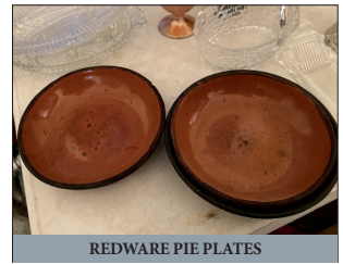
REDWARE PIE PLATES