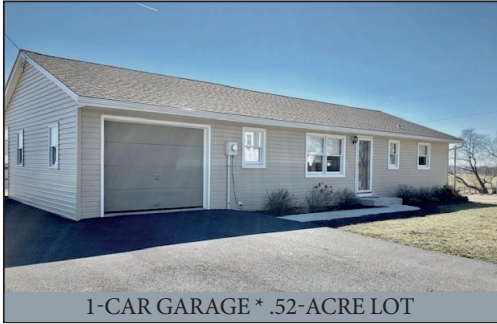
1-CAR GARAGE * .52-ACRE LOT