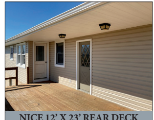
NICE 12' X 23' REAR DECK