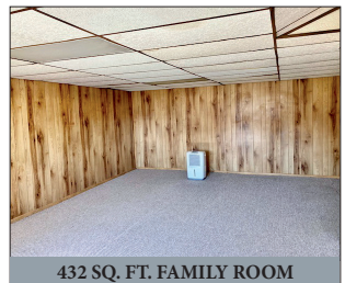
432 SQ. FT. FAMILY ROOM