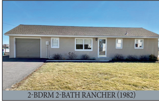
2-BDRM 2-BATH RANCHER (1982)