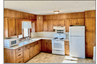
OAK CABINETRY KITCHEN

For photos & complete listing visit www.martinandrutt.com