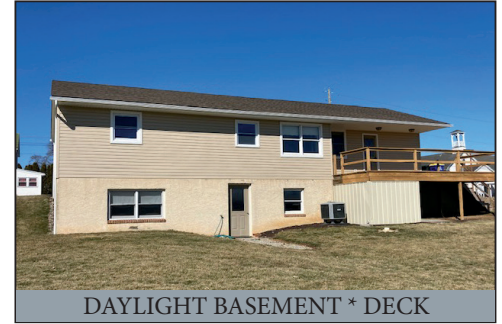
DAYLIGHT BASEMENT * DECK

Located at 582 Voganville Rd. New Holland, PA Earl Twp. Lancaster Co.