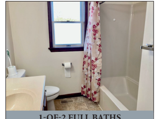
1-OF-2 FULL BATHS