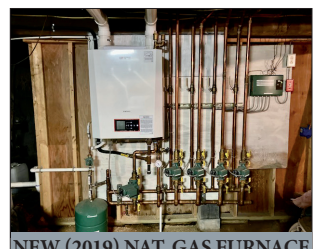
NEW (2019) NAT. GAS FURNACE