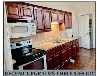
RECENT UPGRADES THROUGHOUT