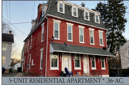
5-UNIT RESIDENTIAL APARTMENT * .36-AC.