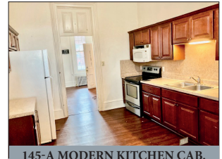
145-A MODERN KITCHEN CAB.

For photos & complete listing visit www.martinandrutt.com