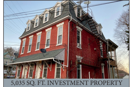
5,035 SQ. FT. INVESTMENT PROPERTY

Located at 145-147 E. Main St. Adamstown, PA 19501