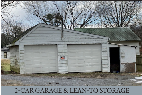
2-CAR GARAGE & LEAN-TO STORAGE