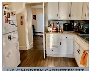
145-C MODERN CABINETRY KIT.