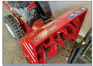
TROYBILT 28" SNOW BLOWER