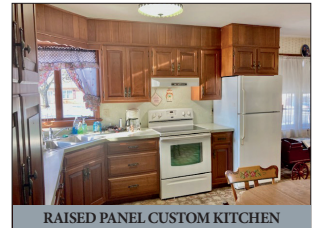
RAISED PANEL CUSTOM KITCHEN

TERMS: Cash, PA check or credit card w/3% fee; food served; sale held under tent, bring a chair!