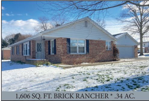
1,606 SQ. FT. BRICK RANCHER * .34 AC.

3-BDRM 1.5 BATH BRICK RANCHER w/2-CAR GARAGE * .34-AC. LOT 2012 GMC SIERRA 4x4 PICKUP * 24-HP JD Z-TURN MOWER * GENERATOR TROYBILT SNOW BLOWER * TOOLS * QUILTS * ANTIQUES * FURNITURE SAT., MARCH 12, 2022 @ 9:30 AM/Real Estate @ 11-AM