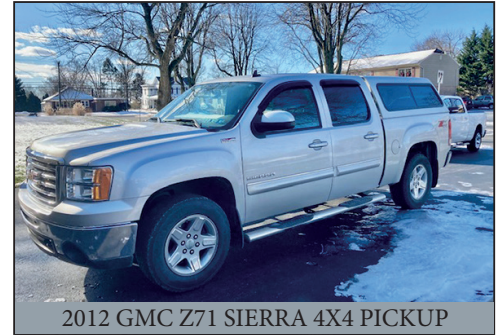
2012 GMC Z71 SIERRA 4X4 PICKUP

Located at 7 Meadow View Dr. Leola, Pa. Upper Leacock Twp. Lancaster Co.