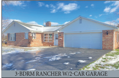
3-BDRM RANCHER W/2-CAR GARAGE