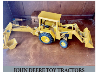
JOHN DEERE TOY TRACTORS