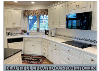
BEAUTIFUL UPDATED CUSTOM KITCHEN

For photos & complete listing visit www.martinandrutt.com