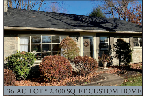
.36-AC. LOT * 2,400 SQ. FT CUSTOM HOME

Located at 75 W. Hillcrest Ave. Strasburg, Pa. 17579 Lampeter-Strasburg Schools