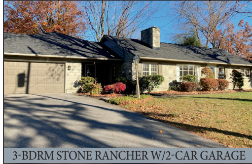
3-BDRM STONE RANCHER W/2-CAR GARAGE