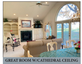
GREAT ROOM W/CATHEDRAL CEILING