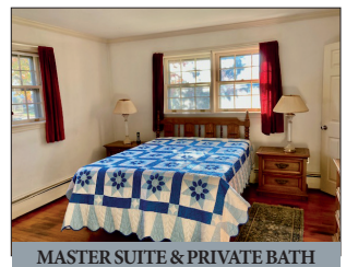
MASTER SUITE & PRIVATE BATH