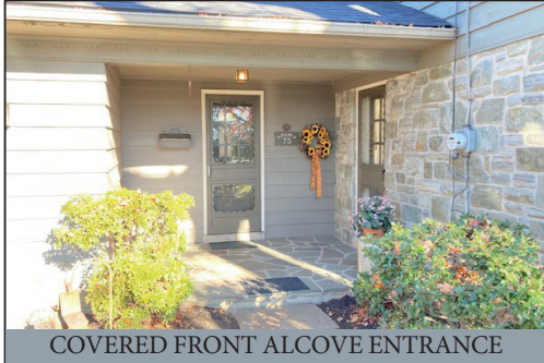
COVERED FRONT ALCOVE ENTRANCE