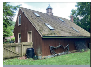
GARAGE W/UPPER LEVEL STORAGE