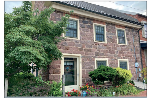
SEMI-DETACHED 2-STY SANDSTONE HOME

Located at 13 S. Reamstown Rd. Stevens, Pa. E. Cocalico Twp. Lancaster Co.