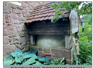
RESTORED BEEHIVE OVEN