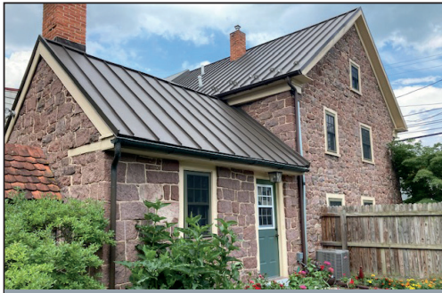
RESTORED 1760'S ERA COLONIAL HOME

2-BDRM 1-BATH SEMI-DETACHED 2-STORY STONE COLONIAL * .20-AC. LOT BEAUTIFULLY RESTORED (1760's) 1,628 Sq. Ft. HOME * 2-CAR GARAGE/SHOP UTILITY BARN * PRIVATE BACKYARD w/GARDEN AREA & PATIO THURSDAY, DECEMBER 9, 2021 @ 2-PM