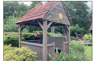
RUSTIC WELL PUMP GAZEBO

REAL ESTATE: consists of a 1,628 sq. ft. semi-detached 2-story sandstone Colonial style dwelling plus an 816 sq. ft. 2-story 2-bay garage/shop on a .20-acre lot. Main floor features a rustic living rm. /dining combo w/HW floors & exposed beams; quaint kitchen w/painted wood cabinetry & appliances; 224 sq. ft. office/studio with walk-in stone fireplace & restored beehive oven w/tile roof; private 12' x12' brick patio; upper level has 2-bedrooms & full bath; attic storage; partial basement w/outside entrance; gas heat/central AC; aux. electric heat; 200 amp svc; 50-yr standing seam metal roof; new insulated tilt-style windows w/lifetime warranty; public water & sewer; annual taxes: $3,728. Outbuildings: include a 2-story 2-car garage/shop w/816 sq. ft., upper level has large insulated storage room/studio; wide paved parking area; 12'x20' utility barn; garden gazebo w/tile roof; large fenced backyard w/ hoop greenhouse & garden area.