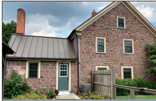
2-BDRM, 1-BATH 1,628 SQ. FT. DWELLING