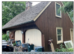
2-STORY 2-CAR GARAGE/SHOP