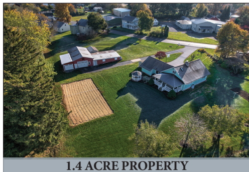
1.4 ACRE PROPERTY