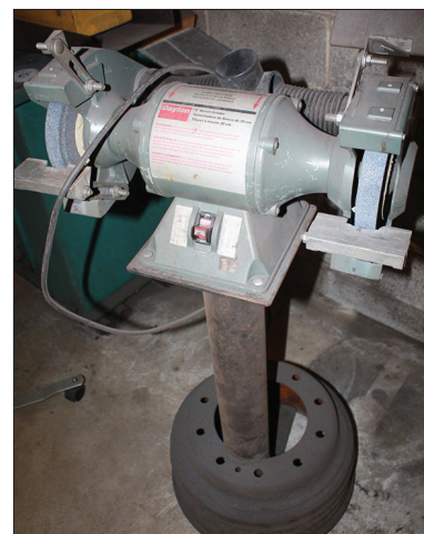
GRINDER ON STAND