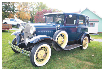
BEAUTIFUL 1930 MODEL-A