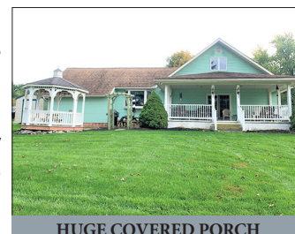
HUGE COVERED PORCH