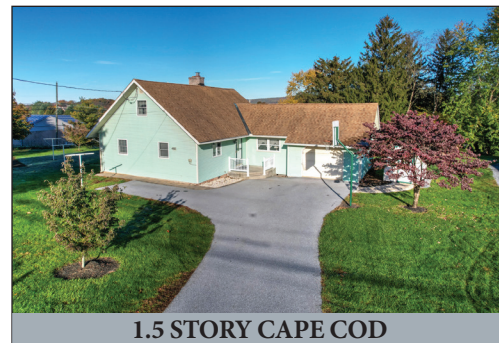
1.5 STORY CAPE COD

Located at 841 W. Brubaker Valley Rd. Lititz Pa. 17543