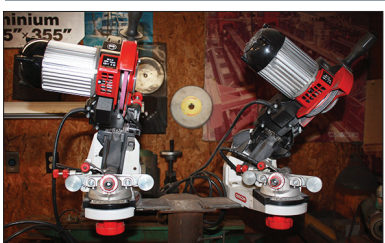
LOTS OF SHARPENING TOOLS