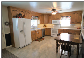
ROOMY EAT-IN KITCHEN