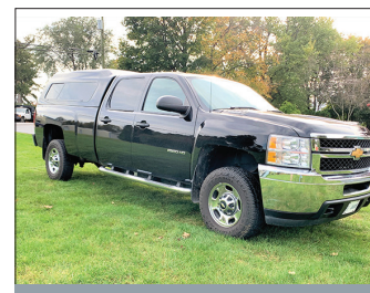
2013 CHEVY 2500-HD