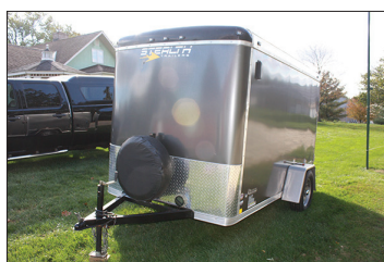
2018 ENCLOSED TRAILER