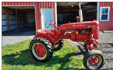
3 FARMALL TRACTORS

Please visit our updated website at www.martinandrutt.com