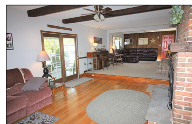
LIVING ROOM 39' LONG