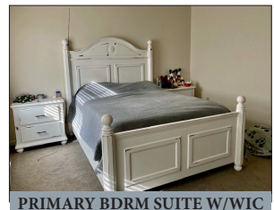
PRIMARY BDRM SUITE W/WIC