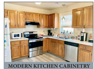
MODERN KITCHEN CABINERY

For photos & complete listing visit www.martinandrutt.com