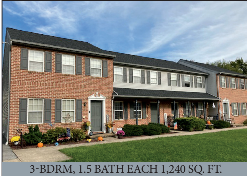
3-BDRM, 1.5 BATH EACH 1,240 SQ. FT.