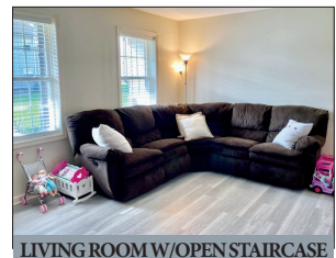
LIVING ROOM W/OPEN STAIRCASE