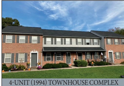
4-UNIT (1994) TOWNHOUSE COMPLEX