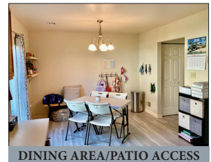
DINING AREA/PATIO ACCESS