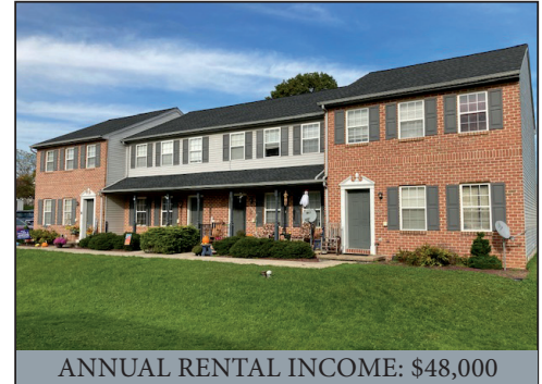
ANNUAL RENTAL INCOME: $48,000

Located at 524 E. Main St. Main St. New Holland, Pa. 17557