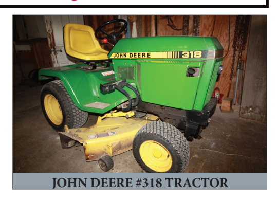
Located at 491 E. Church St. Stevens Pa. 17578

DIRECTIONS: From Hahnstown, travel East on Hahnstown Rd. for 2 miles to property on left or from Reamstown travel South on E. Church St. for 1.5 miles to property on right.