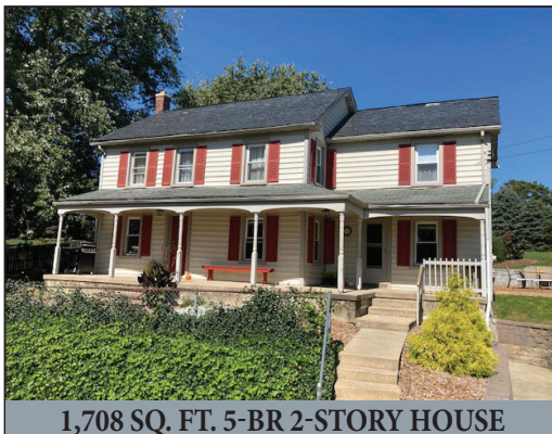
1,708 SQ. FT. 5-BR 2-STORY HOUSE