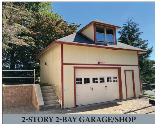
2-STORY 2-BAY GARAGE/SHOP

5-BDRM 1.5 BATH 2-STORY DWELLING * .68-AC. LOT NEW 1-STALL HORSE BARN * 2-STORY CARRIAGE SHED/GARAGE FRIDAY, OCTOBER 29, 2021 @ 6-PM