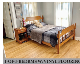
1-OF-5 BEDRMS W/VINYL FLOORING