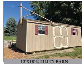
12'X18' UTILITY BARN