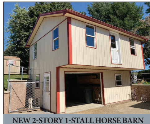
NEW 2-STORY 1-STALL HORSE BARN

Located at 323 Hilltop Rd. Strasburg, Pa. Strasburg Twp. Lancaster Co.