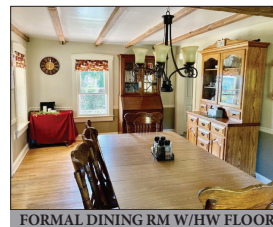
FORMAL DINING RM W/HW FLOOR