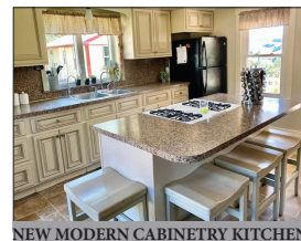
NEW MODERN CABINETRY KITCHEN

Land plot map only, not a survey, measurements are approximate.