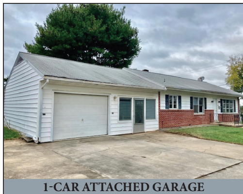
1-CAR ATTACHED GARAGE

3-BDRM 2-BATH 1-STORY (1955) BRICK RANCHER * .14-AC. LOT 1,144 Sq. Ft. * HARDWOOD FLOORS * DAYLIGHT BASEMENT TUESDAY, NOVEMBER 23, 2021 @ 4-PM