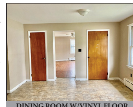
DINING ROOM W/VINYL FLOOR