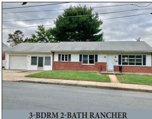
3-BDRM 2-BATH RANCHER