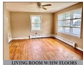
LIVING ROOM W/HW FLOORS