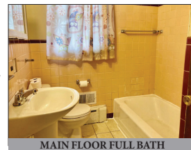
MAIN FLOOR FULL BATH