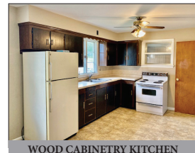
WOOD CABINETRY KITCHEN

For photos & details visit www.martinandrutt.com