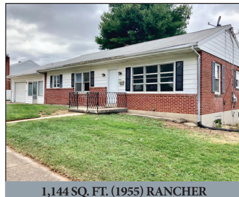
1,144 SQ. FT. (1955) RANCHER

Located at 490 Howard Ave. Ephrata, Pa. 17522