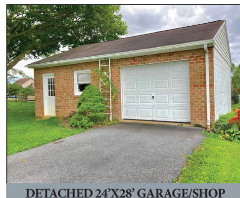
DETACHED 24'X28' GARAGE/SHOP

Located at 660 E. Oregon Rd. Lititz, Pa. Manheim Twp. Lancaster Co.