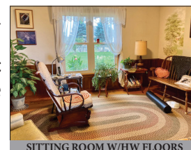
SITTING ROOM W/HW FLOORS