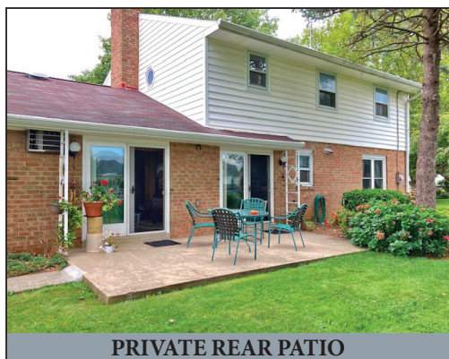
PRIVATE REAR PATIO

3-BDRM 2-BATH (1973) COLONIAL 2-STORY w/2-CAR GARAGE 2,130 Sq. Ft. AREA * DETACHED 1-CAR GARAGE/SHOP * .58-AC. LOT THURSDAY, SEPTEMBER 30, 2021 @ 6-PM