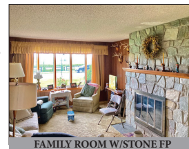
FAMILY ROOM W/STONE FP