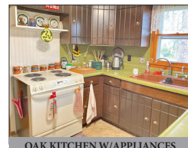
OAK KITCHEN W/APPLIANCES

REAL ESTATE: consists of a 2,130 sq. ft. (1973) 2-story brick & vinyl sided home w/2-car garage plus a detached 1-car garage on a .58-acre lot. Main floor features a 14'x18' formal LR w/bay window, HW floors & a custom raised panel Walnut wall; 12'x12' dining room; Oak kitchen w/appliances & dining area w/ access to private 10'x20' rear patio; 14'x26' family room w/bay window, stone FP & patio access; laundry & full bath; attached 2-car garage; 2nd floor has 3-bedrooms w/HW floors & full bath; lower level 22'x18' rec room; utility room w/canning storage; water treatment system; electric heat; on-site well & septic; annual taxes: $4,641. Outbuilding: a 24'x28' detached brick 1-car garage w/workshop, large level lot w/garden, wide macadam drive & parking area.