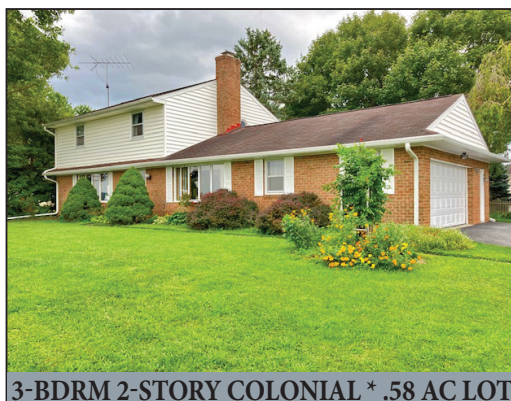
3-BDRM 2-STORY COLONIAL * .58 AC LOT