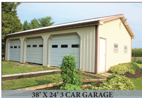
38' X 24' 3 CAR GARAGE