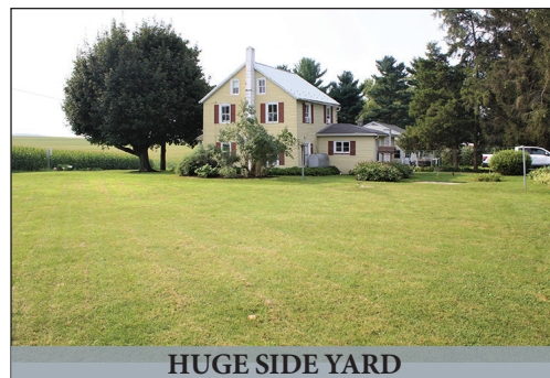
HUGE SIDE YARD

Located at 370 Royer Rd. Lititz Pa. 17543