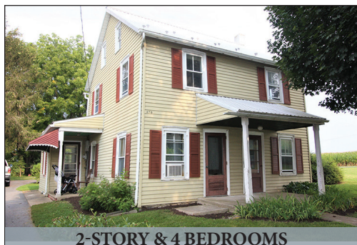
2-STORY & 4 BEDROOMS

2-STORY HOUSE w/ 4 BEDROOMS * COUNTRY SETTING 3- CAR DETACHED GARAGE * .68 ACRE LOT * CORNER LOT DESIRABLE LOCATION * HOUSE NEEDS TLC THURSDAY, OCTOBER 7, 2021 @ 6:00 PM