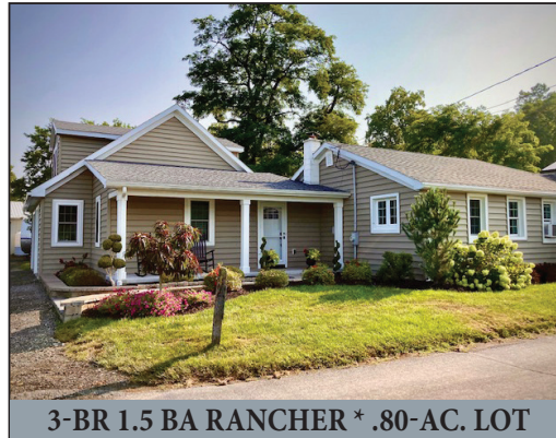
3-BR 1.5 BA RANCHER * .80-AC. LOT