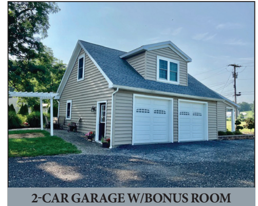
2-CAR GARAGE W/BONUS ROOM

Located at 637 Overlys Grove Rd. New Holland, Pa. East Earl Twp. Lancaster Co.