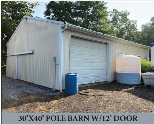
30'X40' POLE BARN W/12' DOOR

2,205 Sq. Ft. 3-BDRM 1.5 BATH RANCHER * RURAL .80-AC. LOT! 2-STORY 2-CAR GARAGE * 30'x40' POLE BARN * GARDEN AREA MONDAY, OCTOBER 4, 2021 @ 6-PM