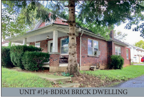
UNIT #1) 4-BDRM BRICK DWELLING