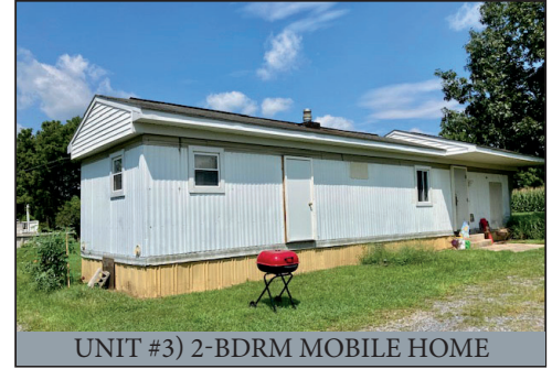
UNIT #3) 2-BDRM MOBILE HOME

Located at 69 W. Church St. Denver, Pa. E. Cocalico Twp. Lancaster Co.