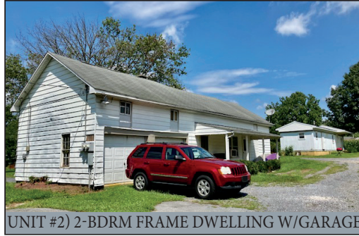
UNIT #2) 2-BDRM FRAME DWELLING W/GARAGE