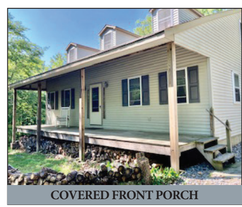
Located at 2363 Jones Mt. Rd. Mifflinburg, Pa. Lewis Twp. Union Co.

DIRECTIONS: From Harrisburg Rt. 15 N to Rt. 104 N to Mifflinburg right on Rt. 45 1-mi. to left on Forest Hill Rd. 4-mi. to left on Rt. 192 to left on Jones Mt. Rd. 2.4-mi. to cabin on left.