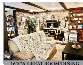
16'X26' GREAT ROOM/DINING