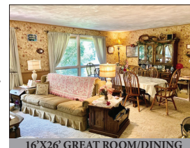
16'X26' GREAT ROOM/DINING