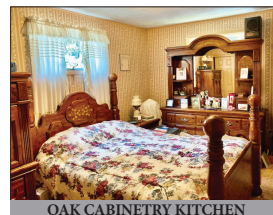
OAK CABINETRY KITCHEN