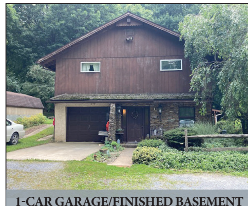
1-CAR GARAGE/FINISHED BASEMENT

Located at 5436 Meadville Rd. New Holland, Pa. Salisbury Twp. Lancaster Co.