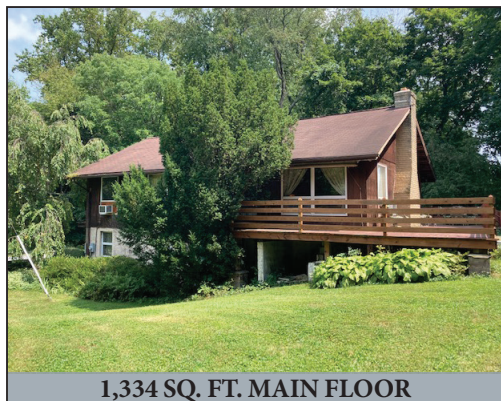
1,334 SQ. FT. MAIN FLOOR

3-BDRM 2.5 BATH RANCHER w/1-CAR GARAGE * 1.80-AC. LOT 1,334 Sq. Ft. MAIN FLOOR * FINISHED BASEMENT * UTILITY SHED THURSDAY, OCTOBER 14, 2021 @ 6-PM