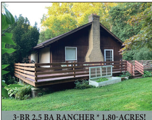
3-BR 2.5 BA RANCHER * 1.80-ACRES!