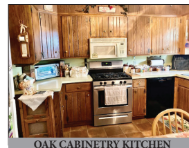
OAK CABINETRY KITCHEN

For photos & full listing visit www.martinandrutt.com