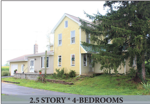
2.5 STORY * 4-BEDROOMS

9.7 LEVEL ACRES * PRODUCE or HORSE FARM 2-STORY HOUSE NEEDS TLC * ANIMAL BARN w/ STALLS ZONED VILLAGE CENTER & AGRICULTURE * POSSIBLE SUB-DIVISION TUESDAY, OCTOBER 12, 2021 @ 5:30 PM