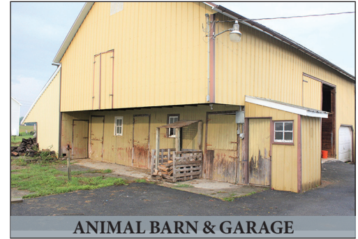
ANIMAL BARN & GARAGE

Located at 220 N. Line Rd. Stevens Pa. 17578