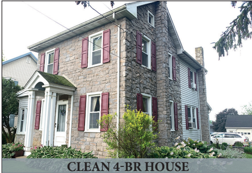
CLEAN 4-BR HOUSE

CLEAN 2.5-STORY FRAMED HOUSE w/ 4 BEDROOMS 1-ACRE LEVEL LOT * DETACHED 48'x 24' 3 CAR GARAGE GUN COLLECTION * LAWN MOWER * GARAGE ITEMS THURSDAY SEPT. 9, 2021 @ 6:00 PM * R.E. @ 6:30 PM