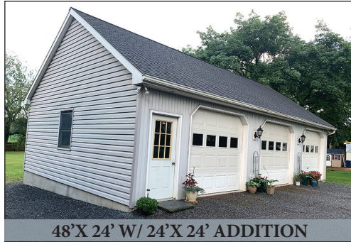
48'X 24' W/ 24'X 24' ADDITION