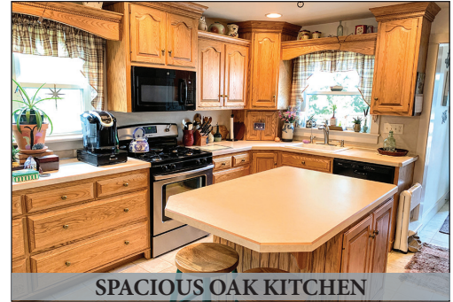
SPACIOUS OAK KITCHEN

Located at 3172 Irishtown Rd. Gordonville Pa. 17529