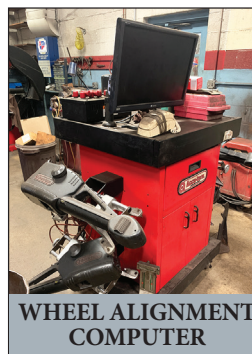
WHEEL ALIGNMENT COMPUTER