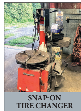
SNAP-ON TIRE CHANGER

Located at 1110 W. Swartzville Rd. (Rt. 897) Reinholds Pa. 17569