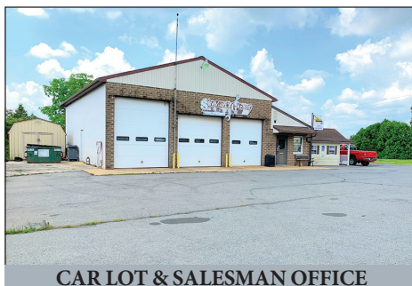
CAR LOT & SALESMAN OFFICE