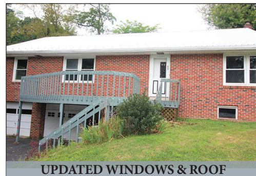
UPDATED WINDOWS & ROOF

Located at 1410 Springville Rd. New Holland Pa. 17557 (Lanc. Co.)