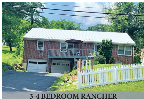
3-4 BEDROOM RANCHER