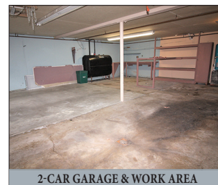
2-CAR GARAGE & WORK AREA

REAL ESTATE: An all brick "Raised Rancher" house w/ 3-4 bedrooms & daylight basement in front on .36 acre lot. House was built in 1960; main level has 2,104 sq. ft; large eat-in kitchen w/ wooden cabinetry, sink window overlooking back yard; open to dining area; oversized front living room w/ Oak hardwood flooring & charming corner window; 3 roomy bedrooms w/ Oak hardwood flooring & closets; full bathroom; front wooden deck. Daylight basement has family room; office/4th bedroom (just needs egress window); good 2-car garage w/ work area; second full bathroom; utility room. Oil fired furnace w/ baseboard heat; elec. domestic water heater new 9-20; on-site well & septic tanks; 200 amp elec. service; new pressure tank in 9-20; updated windows; good soffit & fascia; updated metal roof; low maintenance exterior; macadam driveway; zoned residential; E. Earl Twp; Garden Spot S.D.; total property taxes approx. $3,401. Wonderful investment property or great for first time home buyer. Seems to be a solid house that needs cosmetic updates, come prepared to buy at auction price.