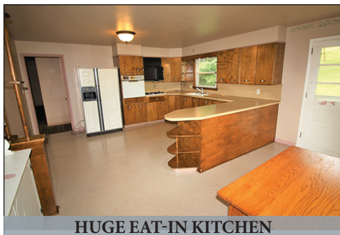
HUGE EAT-IN KITCHEN