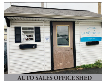
AUTO SALES OFFICE SHED

OPEN HOUSE: Sat. Sept. 4 & 11 from 1-3 PM for info call/text auctioneer @ (717) 371-3333