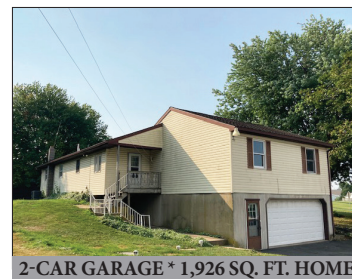
2-CAR GARAGE * 1,926 SQ. FT. HOME

Land plot map only, not a survey, measurements are approximate.