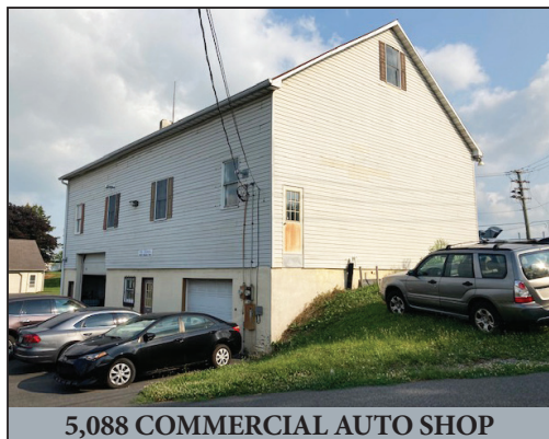
5,088 COMMERCIAL AUTO SHOP