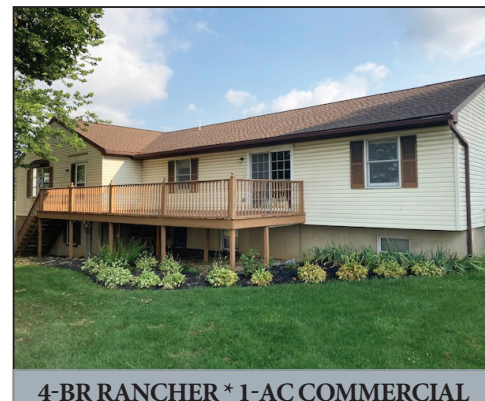
4-BR RANCHER * 1-AC COMMERCIAL

Located at 3430 Division Hwy. (Rt. 322) New Holland, Pa. Earl Twp. Lancaster Co.