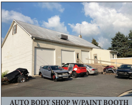
AUTO BODY SHOP W/PAINT BOOTH